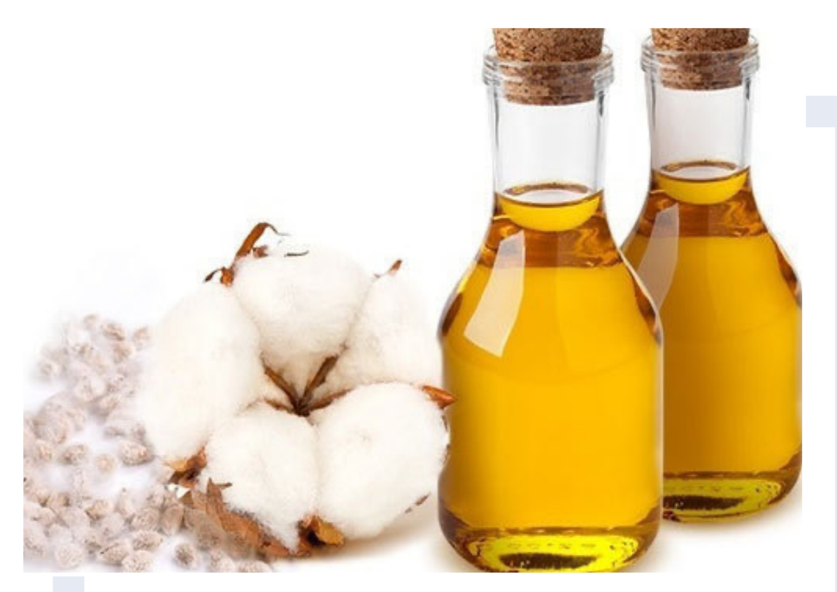
Add value into cotton seeds

Eswatini produce 3000 tons of cotton seed